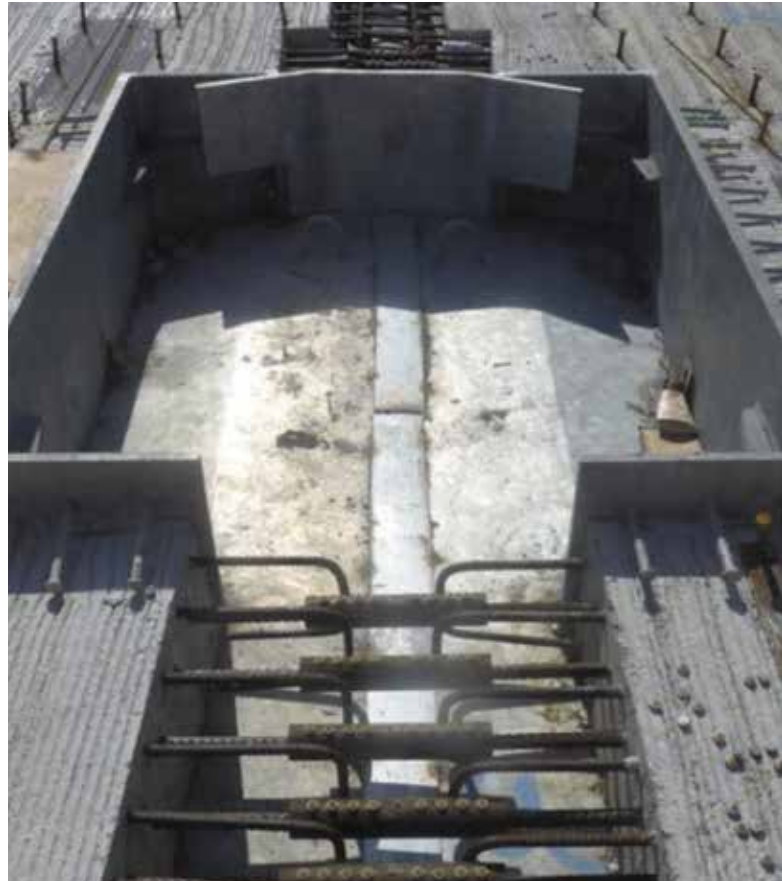
Fig. 9—Column openings.

Beyond the structural challenges and record span lengths achieved, there is one element that lays the foundations for a new way of developing the urban environment. The happy marriage between the structural engineering features of bridge construction and the building industry has paved the way to creating real estate where there seems no opportunity to do so (Fig. 10). The ability to cover an area that effectively was unbuildable suddenly opened up a new possibility of developing apartments, offices, and especially green areas.