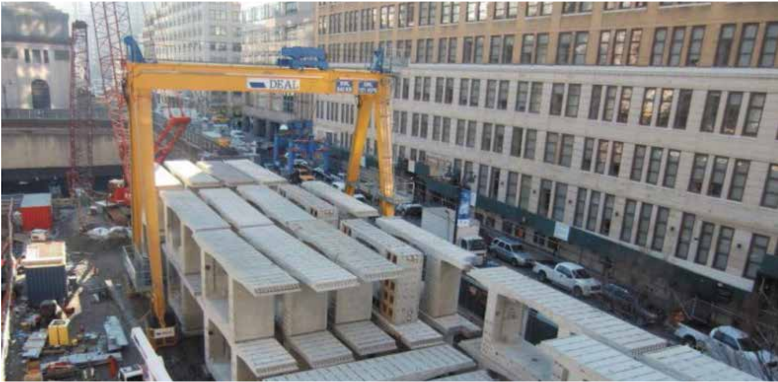
Fig. 8—Staging area.

The logistics of the project are also complex, with work taking place on a staging area effectively the size of a postage stamp (250 x 90 ft [76 x 27 m]) in the middle of Manhattan (Fig. 8). Assembling the LG meant trucking in more than 90 very large and heavy containers to a small, confined area where other contractors were also working.