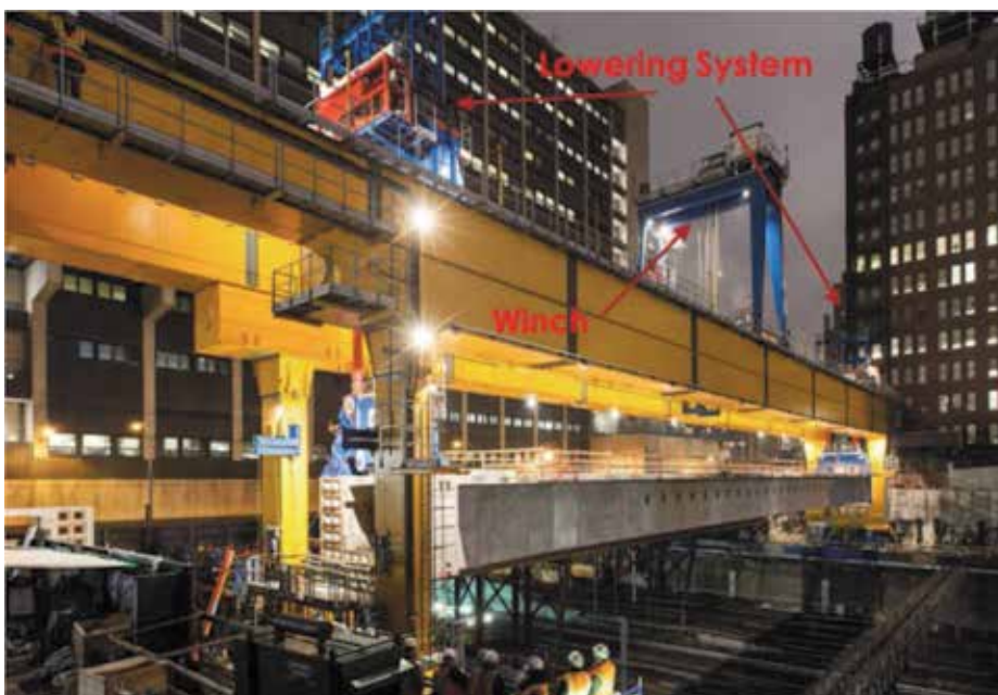
Fig. 1—Manhattan West Platform.