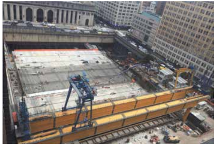
Fig. 7—Cast-in-place operations.

As was expected with the magnitude of compressive stress in the structure, small cracks were observed at locations of high stress concentration, such as at the armored openings after post-tensioning. All cracks were relatively small (<0.01 in. [0.25 mm]) and were sealed with methacrylate crack sealer.