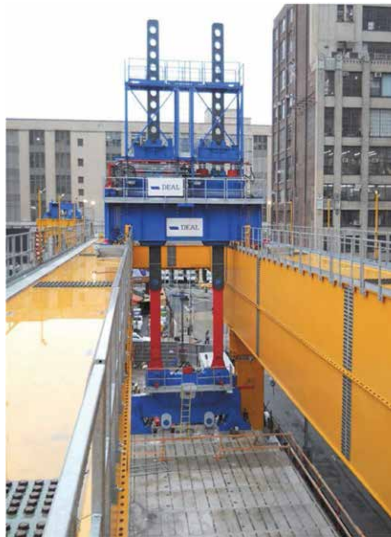
Fig. 5—Lowering system.

The LG was basically a gantry able to move sideways on rails and its main components were a winch and a lowering system (Fig. 5). The gantry could move 10 ft (3 m) per minute and lowered the girders into place at a rate of 0.5 ft per minute with a 1/4 in. (6 mm) precision. The lowering system consisted of hydraulic cylinders