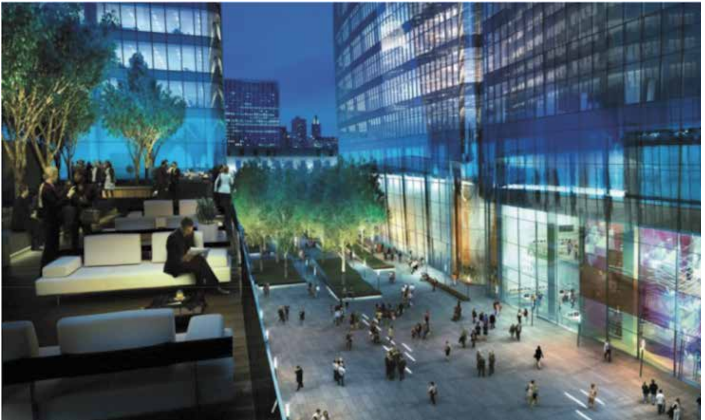
Fig. 10—Rendering of future use of platform.

The value of this approach is immense in cities such as New York where more and more people are looking for places to live and work.