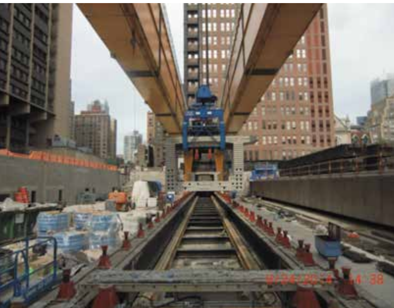
Fig. 4—Underslung system.

particularly contributed to the success of the Manhattan West Project: