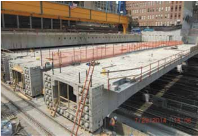
Fig. 6—Post-tensioning on face of pier segments.

with pins and slotted bars (Fig. 5). On each slotted bar, there were two pins that were used alternatively for lifting the girder and for keeping it in position while the jacks restroked. This was a very important feature for the railways' safety: there was, at all times, a positive connection between the bridge and the erection equipment. Even in case of a hydraulic failure, the load would have always been secured by the pin connection. On top of that, the LG was remotely connected with the engineers and technicians in Italy to monitor the functioning and ensure that all the sensor and indicators were working properly. After the first two girders were set, the TPP was removed and the underslung assembly bed was relocated over Span 3 and 4 and used as the stage from which subsequent girders were fabricated.